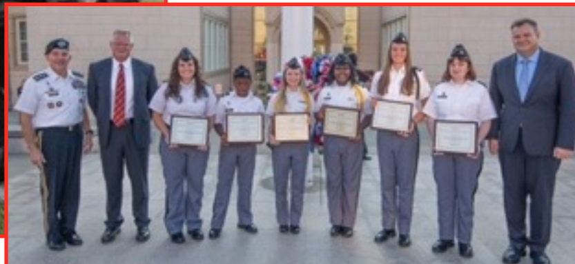
NewDay USA leadership with some 2016 scholarship recipients and their family members