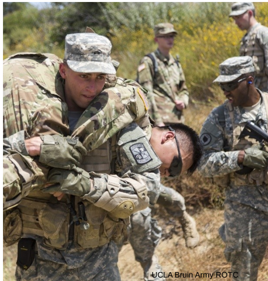
UCLA Bruin Army ROTC